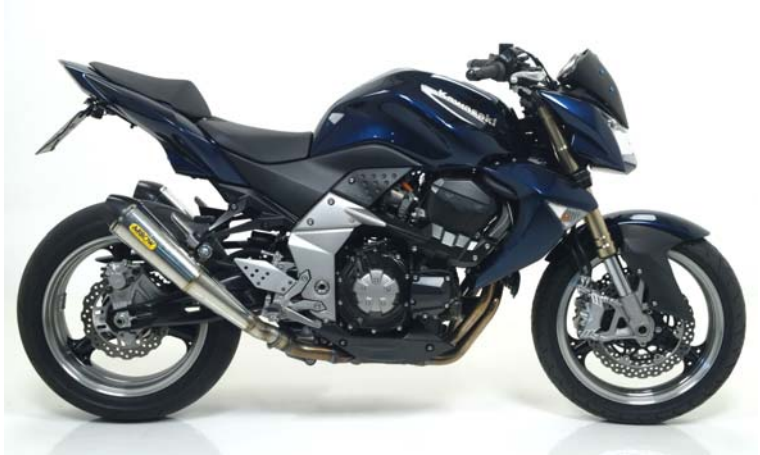
KIT TERMINALE PRO-RACING