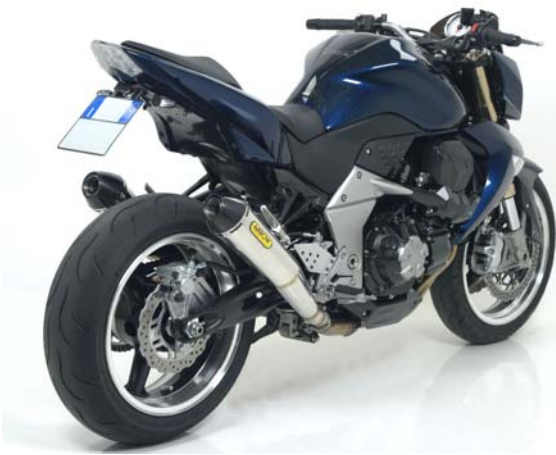
PRO-RACING SILENCER KIT