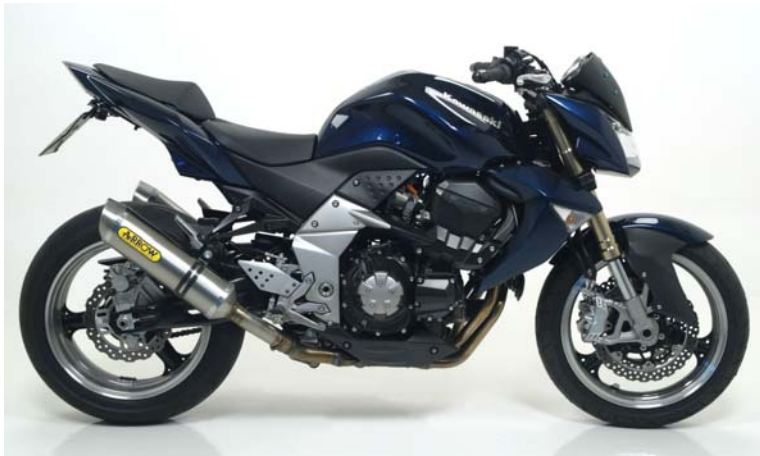
KIT TERMINALE RACE-TECH