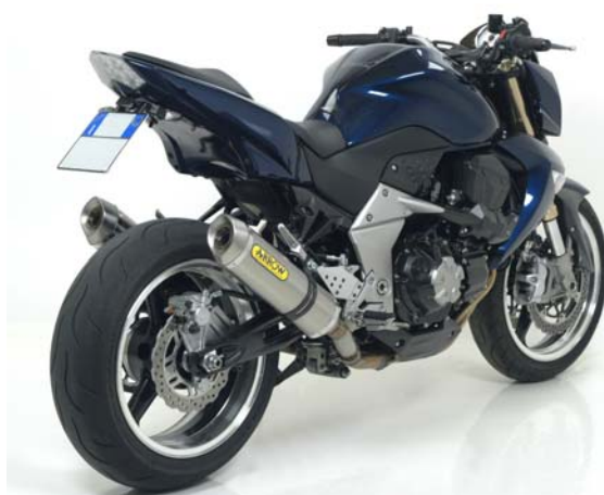
RACE-TECH SILENCER KIT