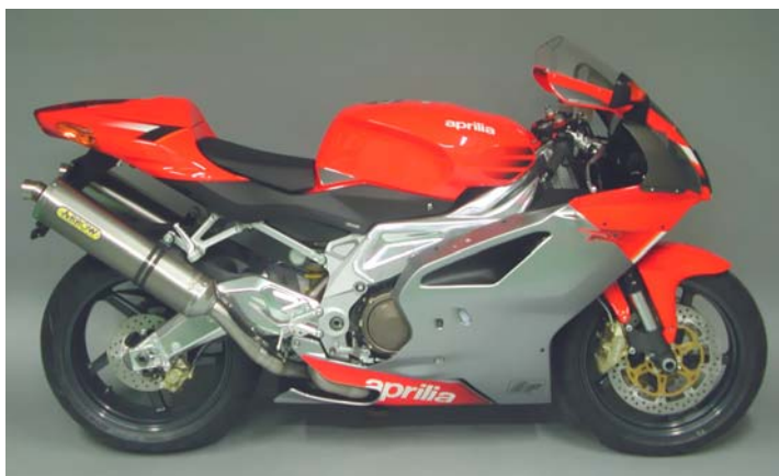
KIT COMPLETO TITANIO