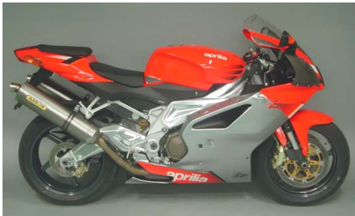
KIT TERMINALI TITANIO