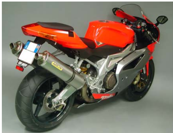
TITANIUM SILENCERS KIT