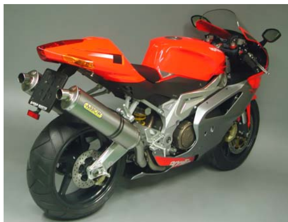
TITANIUM FULL SYSTEM